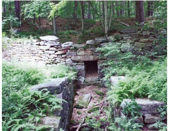
Historical stone bridge foundations along Judd Brook, viewed from the Bernstein Preserve.