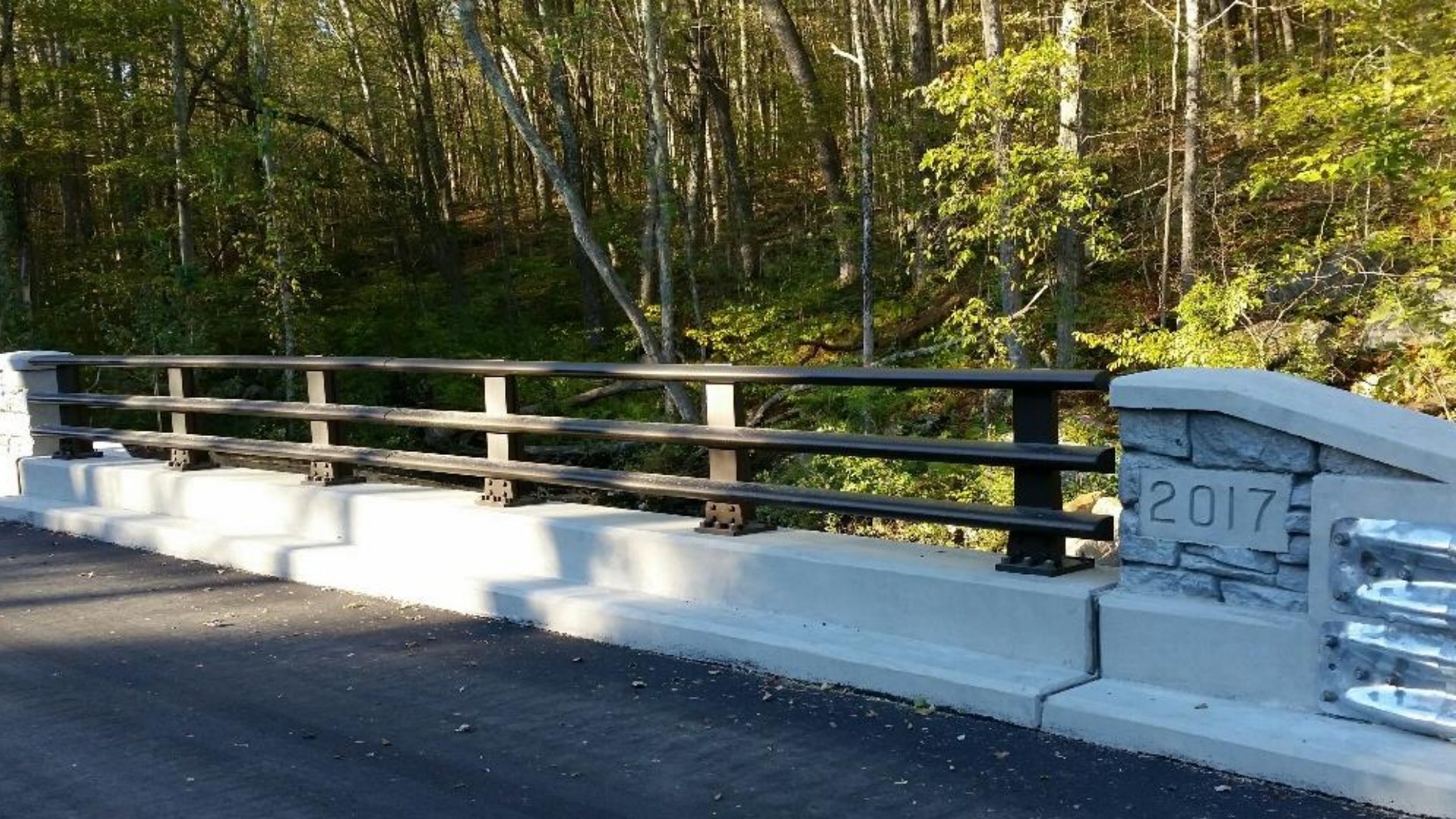
Marjorie Circle Bridge